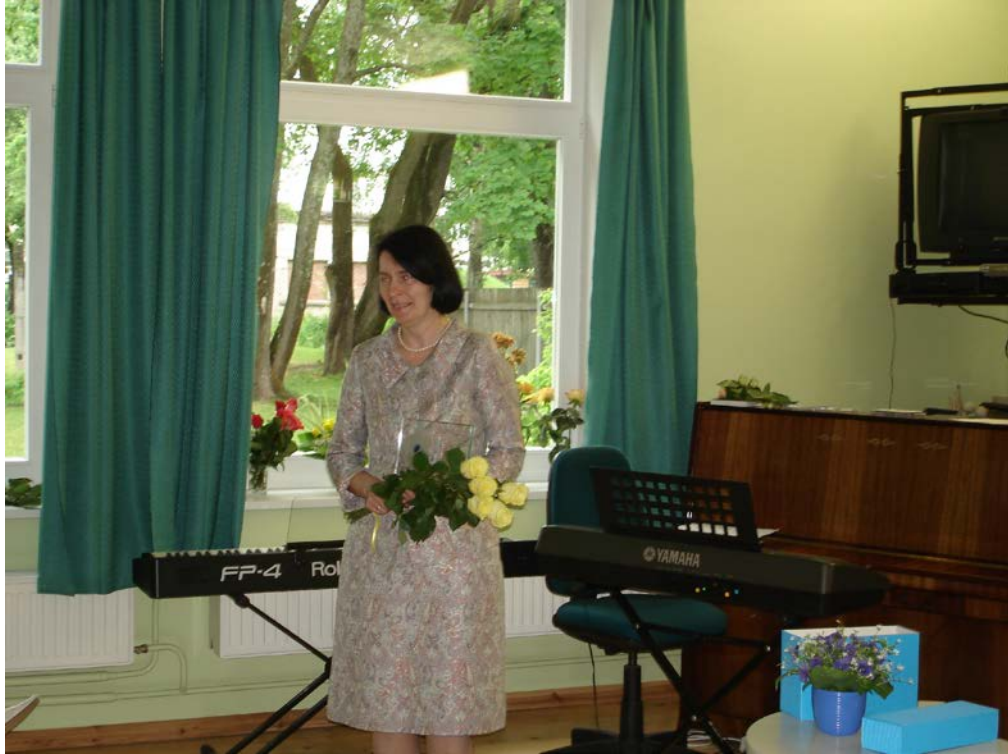
Mother of year at Võru County, May 2009